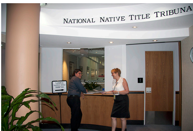
National Native Title Tribunal, Perth Office

The Native Title Act also established the National Native Title Tribunal (NNTT), setting out the NNTT's purpose and way of operating, along with specific powers and responsibilities.